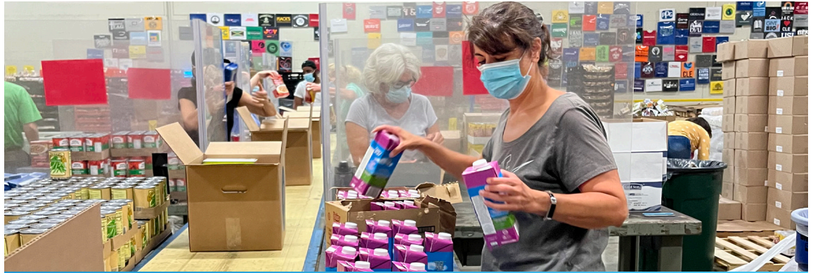
BUILDING SUSTAINABLE CAPACITY TO FIGHT HUNGER AT THE GREATER CLEVELAND FOOD BANK