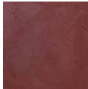
Figure 1b: Unsaturated polyester composites with air release agent

To ensure of maximum performance, Solplus F-Series air release agents should be added to the resin at the start of mixing to avoid air entrapment and bubble formation. The other raw materials are then blended in the normal manner.